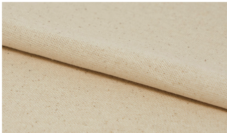
100% Cotton Osnaburg Natural