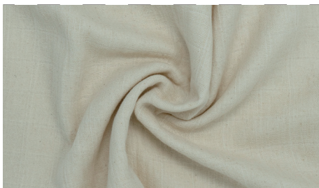
100% Cotton Double Gauze Unbleached