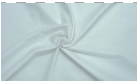
70% Poly, 30% Cotton Blackout Lining Fabric White on white